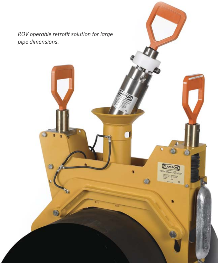
ROV operable retrofit solution for large pipe dimensions.

Since 1995, ClampOn has supplied thousands of «Ultrasonic Intelligent Sensors» to oil and gas companies all over the world, which have benefited from the use of our systems and found them extremely satisfactory. Our systems are preferred to the alternatives because of their repeatability, accuracy and robustness, and our company's expertise in this field. Continuous technology development and personnel training have made ClampOn the winner of all field and laboratory tests in which we have participated, a position we are determined to maintain in the future.