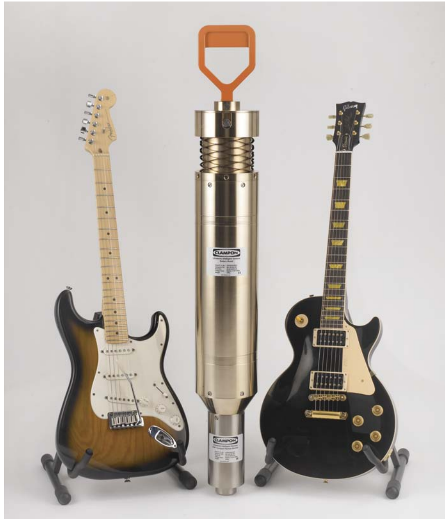
Peak performers always select the very best instruments.

ClampOn programmable automation controllers (PAC) combine the small form factor, reliability and ruggedness of a controller with the flexible and user-friendly client interface known from our software for other platforms. A single controller can handle up to 250 ultrasonic sensors and is simple to control remotely via a network (Network interface with embedded FTP, WEB, Modbus and ClampOn servers). The controller can easily be expanded with hot-swappable IO modules (4-20 mA, relay, CANbus, Profibus etc.); it runs on 24 VDC (6W) and can be mounted on a DIN-rail. The